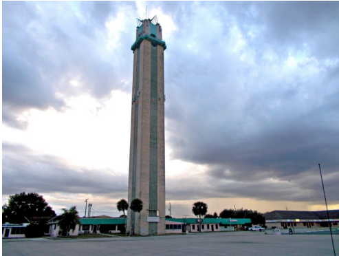
Happiness Tower - Lake Placid, FL 147.045 MHz VHF Site -PL 100

Avon Park -UHF Site 442.350 Mhz -PL 100 Both sites are linked together